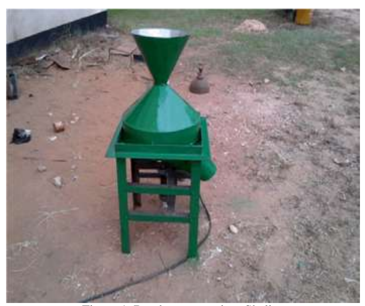
Figure 1. Bambara groundnut Sheller